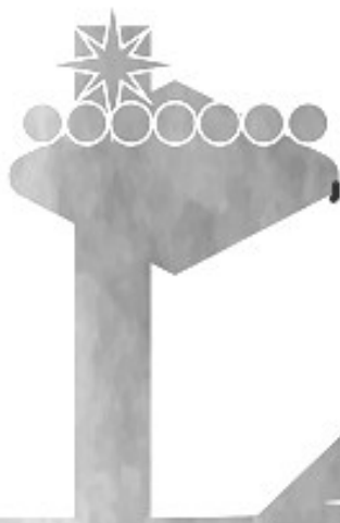
Table reservation forms for tables of 12 are now available in the narthex. Table reservations are due March 12. Spirit Dinner & Auction tickets will be available beginning Feb. 25 and will continue through March 12. Tickets are $50. Dinner will be catered by Kerry's of McCool Junction and will include your choice of prime rib, chicken marsala, or a vegetarian option.