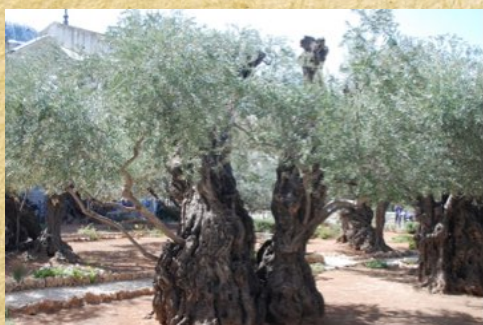
Olive Trees in Garden of Gethsemane