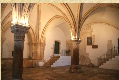
Cenacle - the Upper Room

St. Peter Gallicantu – Mt 26:57-75; Mk 14:53-72; Lk 22:54-71; Jn 18:12-27; Ps 88