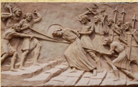
Reliefs of Jesus walking the ancient stairs next to Caiaphas' house

Running next to Caiaphas’ house are ancient steps that would have been the highly traveled path out of the city and down to the Kidron Valley and the Mt of Olives. After the Last Supper, Jesus would have walked down these steps in friendship with his Apostles on their way to the Garden of Gethsemane. But once Jesus is betrayed by Judas, and his Apostles flee, Jesus is bound and roughly led up these same steps to be interrogated at Caiaphas’ house. Two beautiful stone carvings at the top of these stairs recall these scenes.