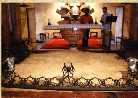
Rock of Christ's Agony in the Garden

Just outside the southwestern wall of Jerusalem's Old City is the Cenacle – the Upper Room. Here is remembered Jesus' Last Supper Passover meal where he instituted the Eucharist. Israel and the Jews celebrated the Passover to remember and give thanks for God's deliverance of his people from slavery and death in Egypt at the time of the Exodus. At the Last Supper Jesus not only celebrated and recalled that first Passover, but he also gave thanks for the deliverance that he knew his heavenly Father would bring from his approaching suffering and death on the Cross (a deliverance that happens gloriously at the Resurrection). Interestingly there is no mention of a lamb at this Passover meal, a detail that reminds us that Jesus himself is the sacrificial lamb, just as John the Baptist had proclaimed, "Behold, the Lamb of God" (John 1:36).