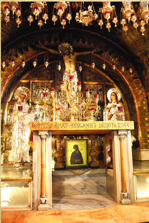
Altar over the site of Calvary

The chief priests have Jesus brought before Pilate. Unaware that he who is Truth and Life stands before him, and even though he knows Jesus is innocent, Pilate condemns Jesus to death. After being scourged and having a crown of thorns woven upon his head, Jesus carries his cross through the Old City and up the hill of Calvary. Along this Way of Sorrows, the Via Dolorosa, beginning at the Chapel of the Flagellation and ending at the Holy Sepulchre, are marked out the Stations of the Cross. Even though the city has enlarged to incorporate Calvary within its expanded city walls, walking along this Way it is still possible to feel the ascent that Jesus would have made through the city, passing outside the old city gate and up to Calvary. Early in the morning, while the city is still quiet, so as to make our journey more prayerful, we will walk the Via Dolorosa, praying the Way of the Cross as we go, and stopping at each of the stations.