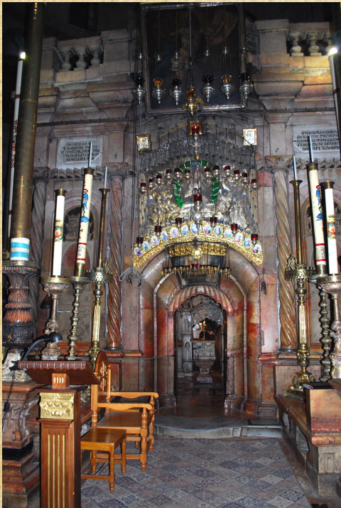
Entrance to the Tomb of Christ

Jesus' body is taken down from the cross with the help of Nicodemus and Joseph of Arimathea. Because of the approaching Sabbath and Passover, Jesus' body is quickly bound in linen cloth and prepared for burial. Jesus is buried in a tomb nearby Calvary and a stone is rolled in front of the cave. It is to this cave on Easter Sunday, that Mary Magdalene and some women will return, bringing spices to anoint Jesus' body at the first rays of dawn's light. But the tomb they will find empty, and the risen Lord will send Mary Magdalene with the good news of Jesus' Resurrection to Peter and the Apostles.