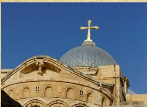
Dome of the Holy Sepulchre

• When Jesus encounters the disciples on the road to Emmaus, St. Luke tells us that “beginning with Moses and all the prophets, he interpreted to them in all the scriptures the things concerning himself.” (Lk 24:25-27) Certainly one of the prophetic passages Jesus would have reminded the disciples of was Isaiah 52 and 53, so that they might better understand his suffering and death. Read Isaiah 52:1 - 53:12 and reflect on Jesus' fulfillment of these words.