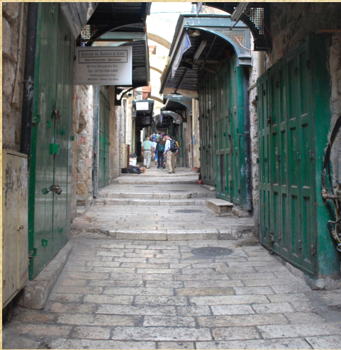
Street in the Old City of Jerusalem along the Via Dolorosa

Tomb – Mt 27:57-66; Mk 15:42-47; Lk 23:50-56; Jn 19:31-42