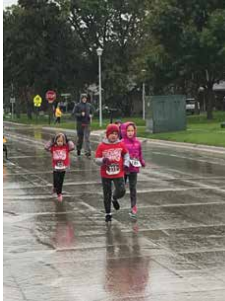
Parish youth participate in last year’s 5K Run, despite rainy weather.

This support is essential to the overall longevity of our school. Through their fundraising efforts, the PTO has been able to take some of the burden off the school budget and to purchase needed equipment and materials. In the past, this has included field trip funds, playground equipment, new iPads and curriculum updates. The PTO also coordinates room parents for each classroom and hosts special events such as the