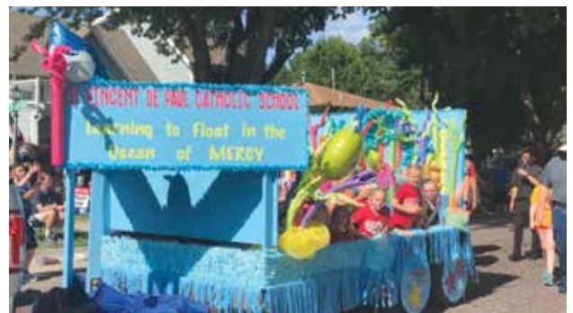
The community enjoys the PTO's annual Fourth of July float in the Seward parade.