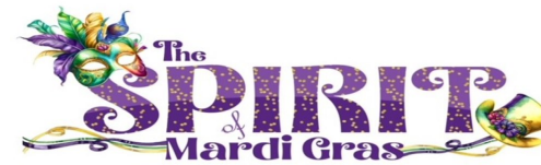
Table reservations for "The Spirit of Mardi Gras" are due this weekend! Don't have a group of 10 to fill a table? That's okay! Sign up with a friend or 2 and come enjoy a delicious meal, drinks, desserts, and entertainment! Stop by our table after Mass and get signed up!

CHOIR DATE—Sunday February 23rd @ 10 a.m. Mass. Practice will begin @ 9 a.m. in music room.